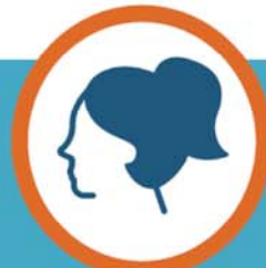
HAIR TIED BACK