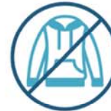
DRAW CORD CLOTHING